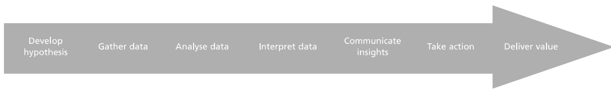
Figure 5 The performance planning value chain

message differ by changing the angle from which we look at the data? It's important to separate this step from analysis. Once the charts and graphs have been completed in the previous step, the question is: what does this mean for the business? It's here that thinking as a detective becomes crucial. Tools include information visualisation and benchmarking.